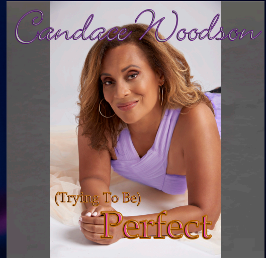
(Trying To Be) Perfect